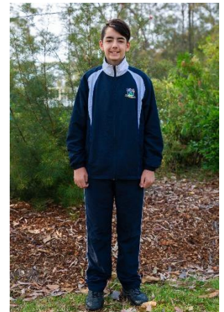
JUNIOR BOYS AND GIRLS