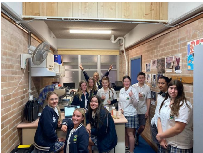
Year 12, 2020

Each year the Coffee Bean Café is run by the students. This is a part of their competency-based training in the Hospitality course. We would like to say farewell to the Year 12 cohort who have done a fantastic job this year honing their barista skills. We welcome the Year 11 cohort who are quickly becoming efficient with their food and beverage preparation and service.