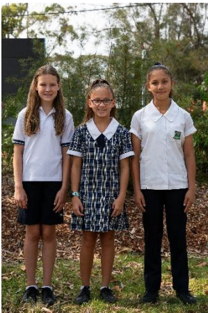
JUNIOR UNIFORM GIRLS

The photographs below show the major changes for the new junior uniform. Note: Girls are still able to wear the FHS navy shorts with the blouse or polo shirt as part of our school uniform.