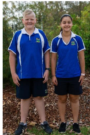
BOYS AND GIRLS SPORTS UNIFORM