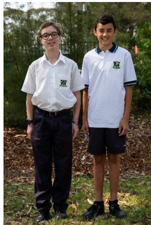
JUNIOR BOYS UNIFORM