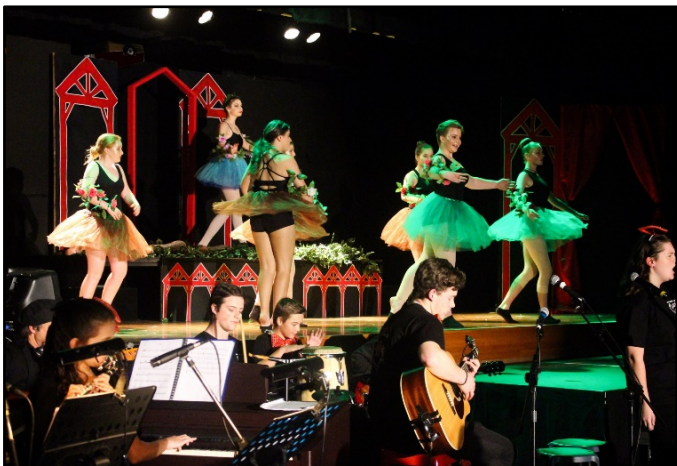
One of the dance sequences from "A Midsummer Night's Dream."