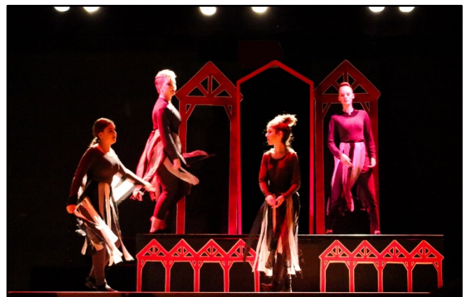
"The Tempest" opened the show with this exciting dance sequence.