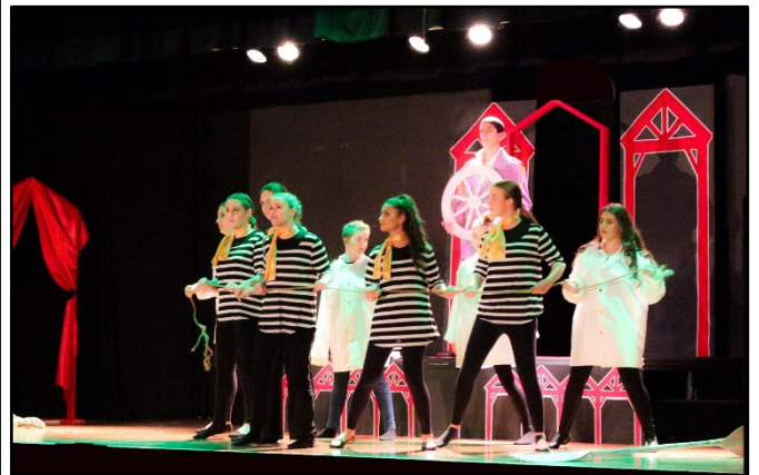
More from "The Tempest" - tremendous performances from these actors!