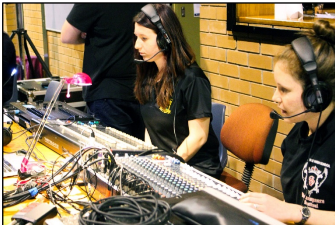
Our technical team was excellent and provided great support.