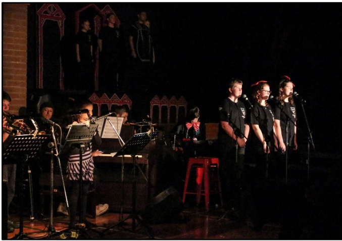
Musicians from Figtree Heights Public School joined our band for the evening.