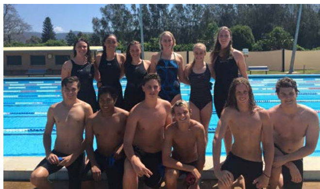
Boys and Girls 6 x 50 Relay teams