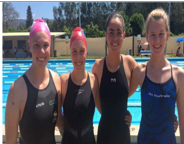
17+ years girls Relay