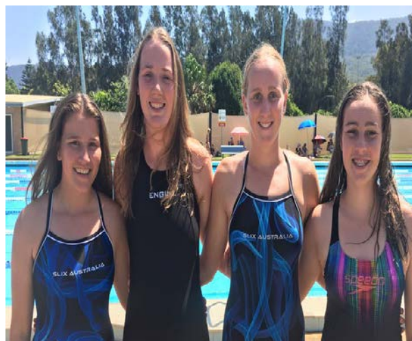
15 years girls Relay