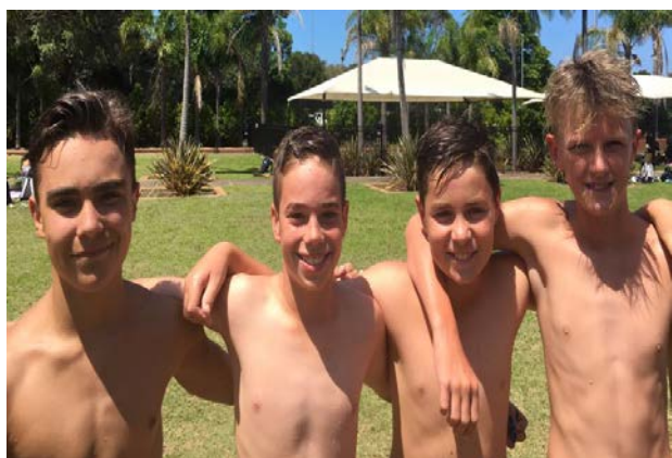
13 years boys Relay