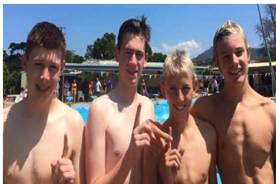
15 years boys Relay