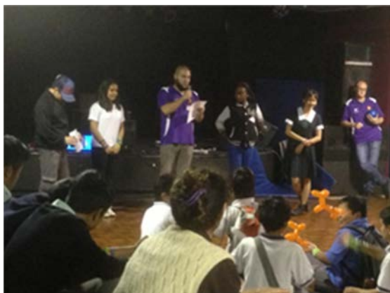
Speaking about personal experiences and coming to Australia at the Youth Conference

The Learning Support Centre has been the hub of activity at Figtree High School in 2013. We are thrilled that students are accessing the centre at recess and lunch daily. Here students are offered an opportunity to study with assistance and/or to socialise in a safe and positive area.