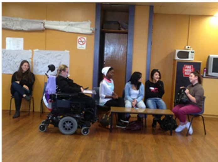
The girls acting out a scenario at the In the Mix day

This year some of our year 10 students from refugee background were also involved in workshops such as the RAW Program, where they were taught skills necessary to apply for long term employment or entry into tertiary studies. Selected Year 7, 8 and 9 students from LBOTE participated in the Multicultural Youth Conference, where they were given knowledge about specialised topics, improved nutritional understanding and increased awareness of community and support services.