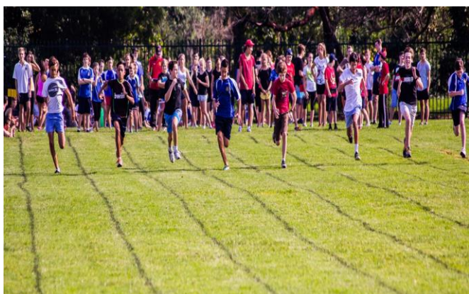
The 13 years boys competing in the 100m