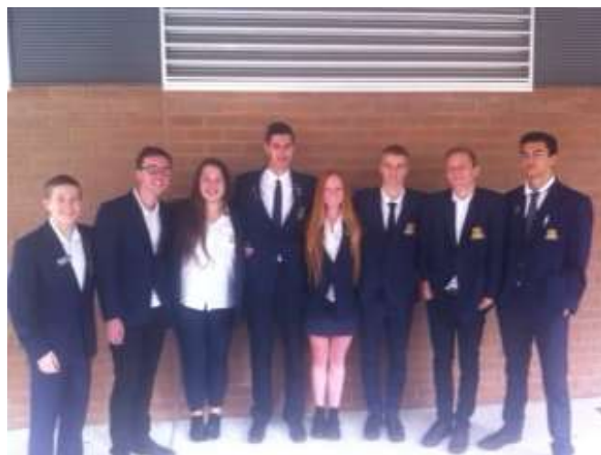
Figtree High School Senior Debate Team

Congratulations to all students involved!