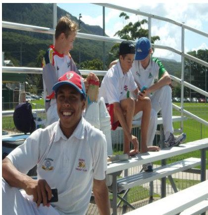
Waiting to bat.