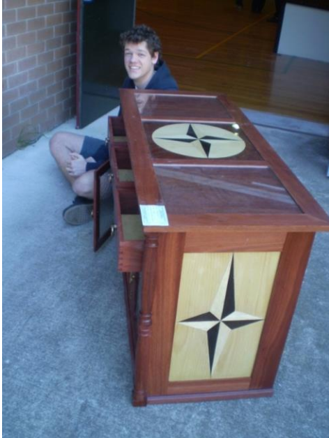
Matt DeJong side table